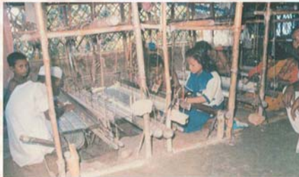
Artists are at work for weaving Jamdani sarees

It is a time to take apporpriate measures and initiatives for populatizing multiple uses of Jamdani fabrics—the pride of our country and symbol of aristocracy. The Government, particularly the Ministry of Textiles and Jute, Bangladesh Handloom Board and other different private organizatiosns are all working to this end.