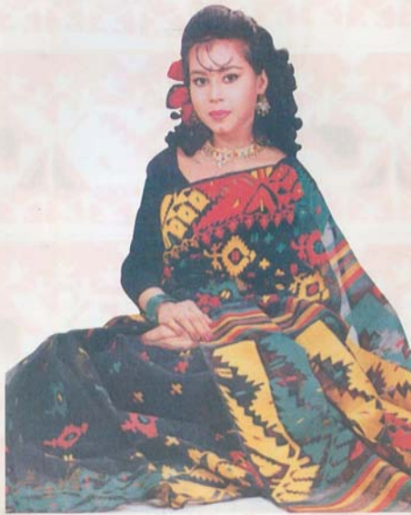
A Lady expresses her beauty in Jamdani saree